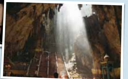
• Batu Cave