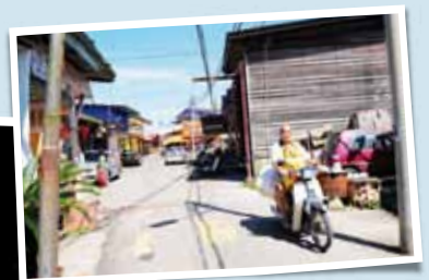
• Kuala Selangor Village