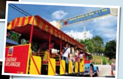
• Melawati Hill