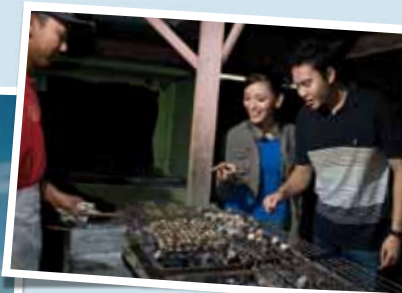
• Grilled Fish Pantai Remis