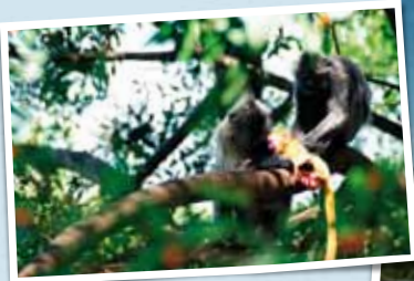
• Silver-leafed Monkeys