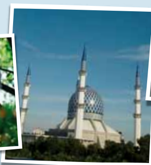
• Blue Mosque