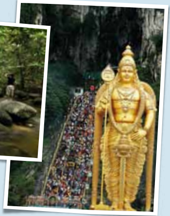
• Batu Caves