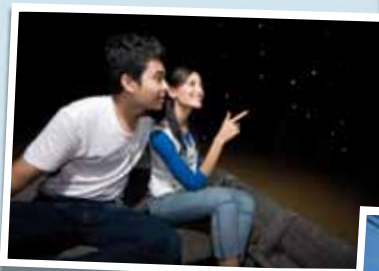
• Fireflies at Kampung Kuantan

For more details, check out the WCOA 2010's pre-and post-tours. It also offers optional half day tours such as the Kuala Lumpur countryside and Batu Caves Tour.